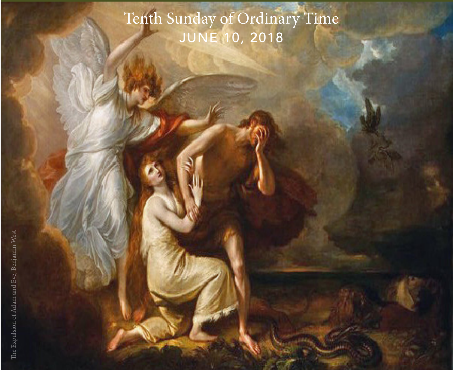
The Expulsion of Adam and Eve, Benjamin West

Tenth Sunday of Ordinary Time JUNE 10, 2018