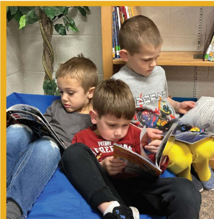
PRE K-12TH GRADE