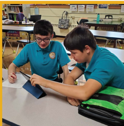
SMALL CLASS SIZES