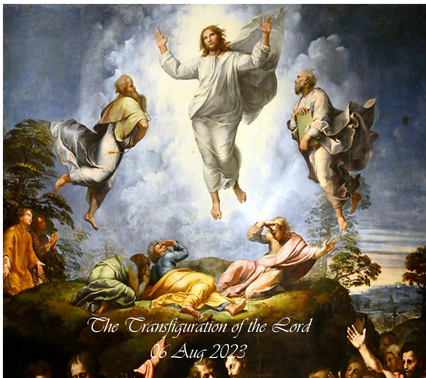
The Transfiguration of the Lord 06 Aug 2023